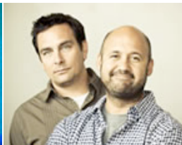
THE SKIT GUYS